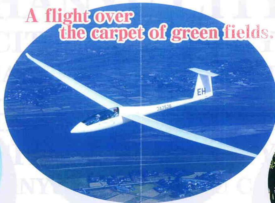
Flying on a glider

A flight over the carpet of green fields.