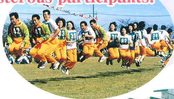
Citizens' Sports Festival

Loud cheers are sent to the boisterous participants!